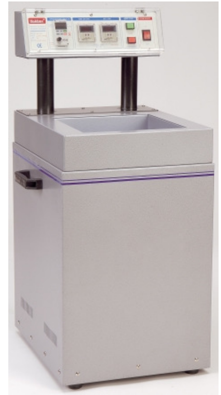
Larger models available.

All units are supplied with a see-through acrylic bowl & lid, as well as stainless steel pins. Model FMP4 includes auto-reverse and variable speed. The larger models, FMP-735 and 750, have programmable control panels with LCD panels, speed control, and timers for both clockwise and counter-clockwise cycles.